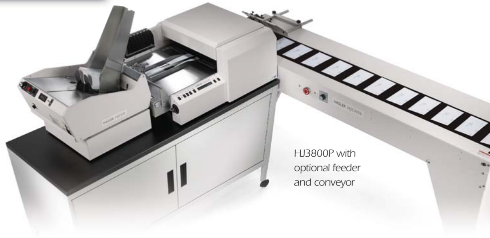
HJ3800P with optional feeder and conveyor