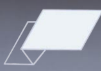
HALF ACCORDION FOLD